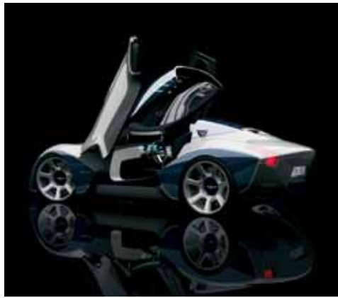
Rendered in Autodesk® Alias® software. Model courtesy of Paulin Motor Company AB.