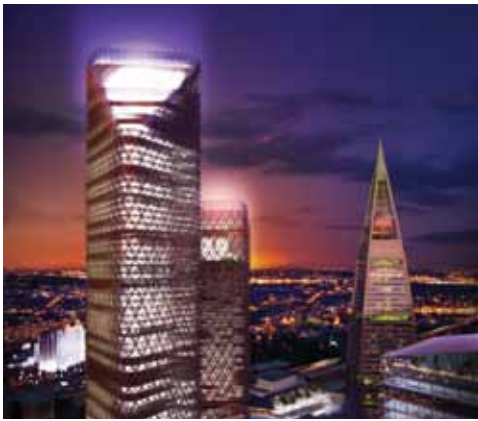
Image modeled in Autodesk® 3ds Max® software.