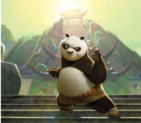
Kung Fu Panda™ & © 2008 DreamWorks Animation L.L.C. All Rights Reserved.