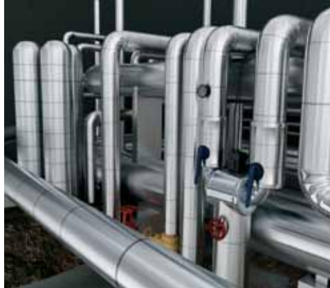
Image modeled in Autodesk 3ds Max.