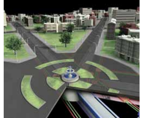
Image modeled in Autodesk 3ds Max.

As a world leader in 2D and 3D design, engineering, and entertainment software, Autodesk is providing the tools to help customers seize opportunities created by a new global business environment—a place where design has become the great competitive differentiator.